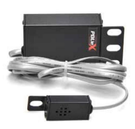
Temperature/ Humidity Sensor